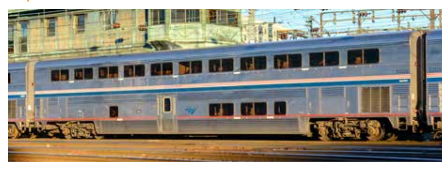
Top white pinstripe = 1/4"tall Other pinstripes = 1 13/32" tall, each